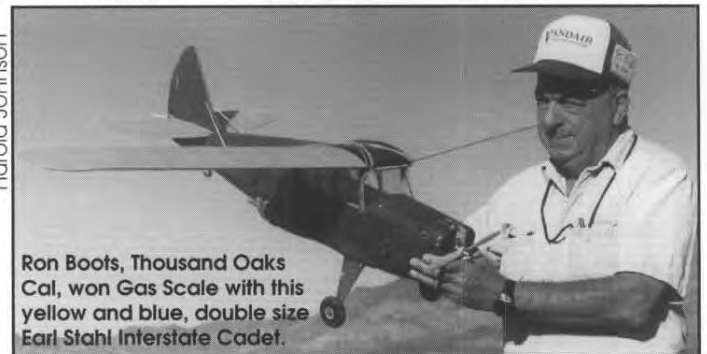
Ron Boots, Thousand Oaks Cal, won Gas Scale with this yellow and blue, double size Earl Stahl Interstate Cadet.